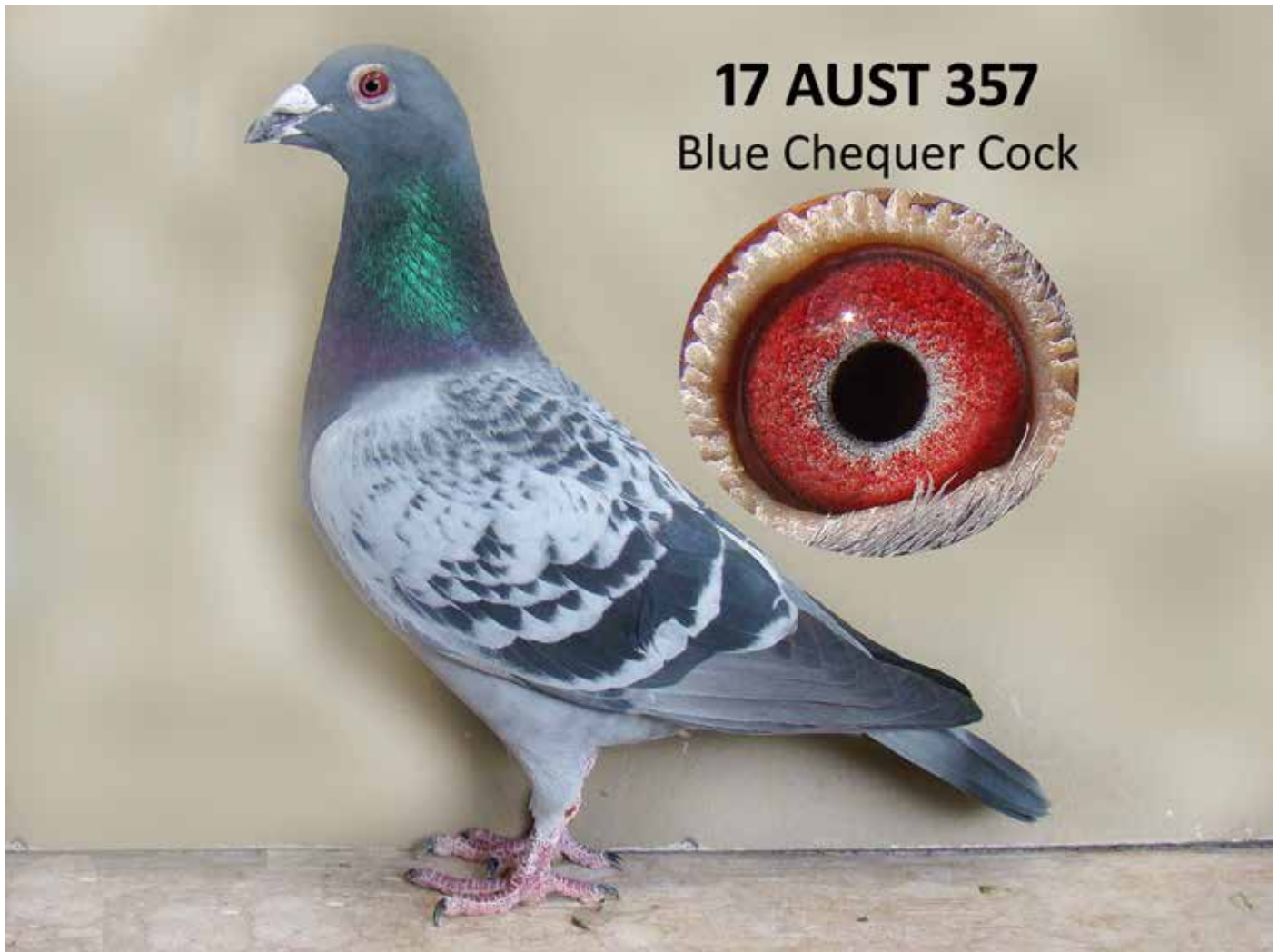
17 AUST 357 Blue Chequer Cock

Not many go from start to finish all the way to 950 klm!