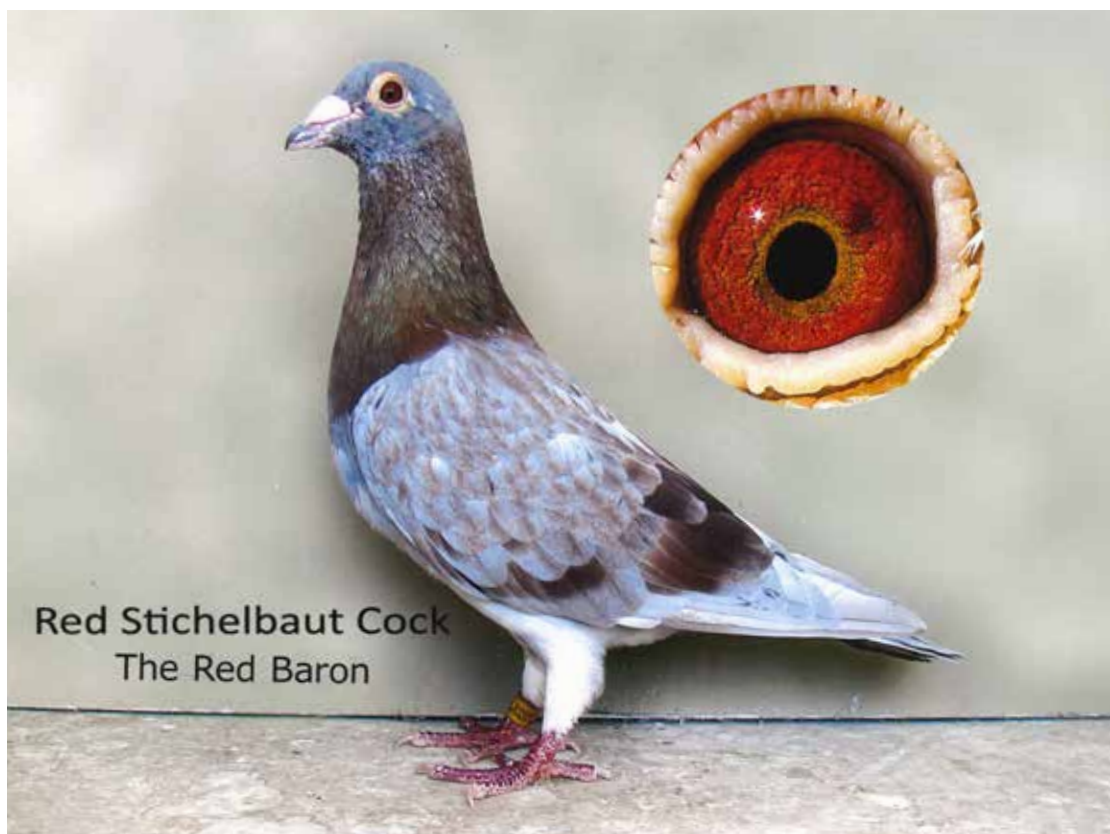
Red Stichelbaut Cock The Red Baron

These pigeons are not just in Club racing, they are racing against the best flyers in Australia in Open races.