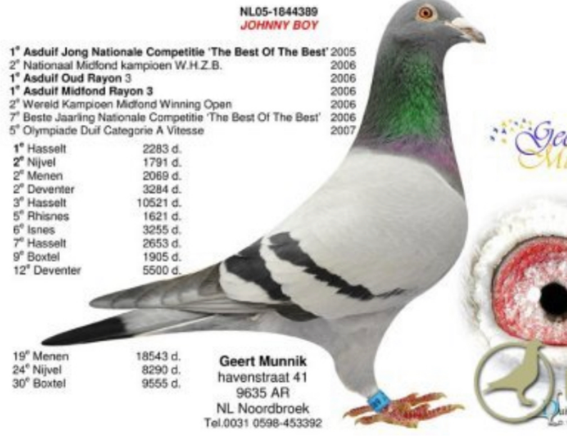
Direct daughter & grand children to t world Famous JOHNNY BOY. Available