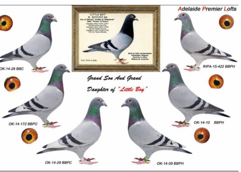
6 Grand Children to Little boy. Available